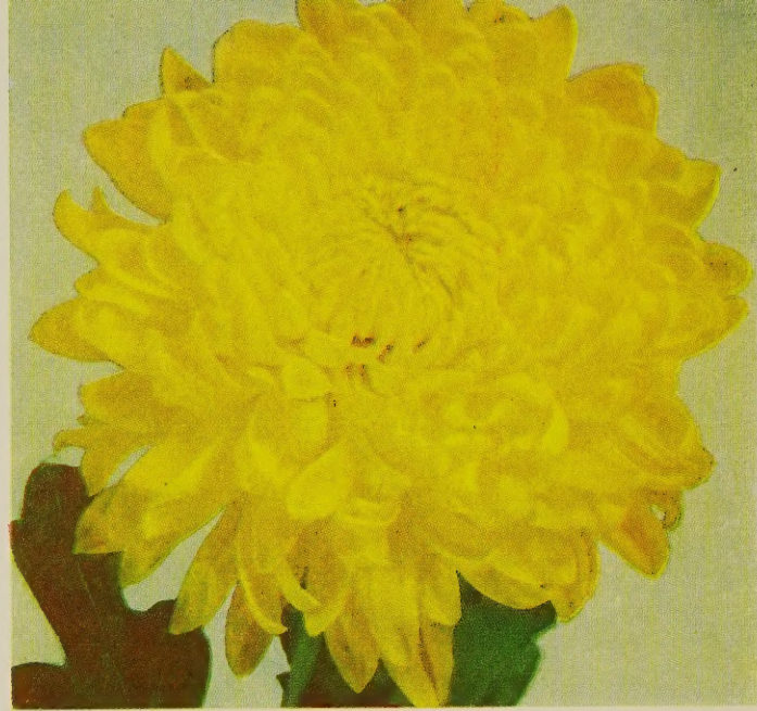
BUTTERSCOTCH. $1.00 each; 3 for $2.50